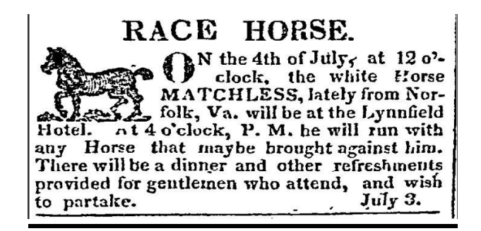
Above is an excerpt from the Salem Gazette July 3, 1821.

Believe it or not, in the early 1800's when turnpikes such as the Newburyport Turnpike (which is now part of Route 1) were finished, these roads proved ideal for horse racing. Laws restricted turnpikes, requiring them to follow a straight path regardless of inconveniences in the way. These straight paths prompted horse racers to travel from as far away as a Virginia to compete. These races were formal and sanctioned races, which often included a dress code. Riders were required to be "neatly dressed in a silk jacket, jockey cap, pantaloons, and half boots, or they will not be permitted to ride." The Lynnfield Hotel was built along the Newburyport Turnpike for the convenience of travelers as well. Horse racing did not stop with the Newburyport Turnpike either, as the Salem and Lynn turnpikes developed trotting races as well. This information is credited to the 1806 Newburyport Herald, and the 1821 Salem Gazette. So next time you travel down a straight turnpike, just envision the horses that used to race those tracks! If you want to see a milestone on Newburyport Turnpike, milestone 7 is a good option, as it can be viewed from the parking lot across from Rowley Marketplace!